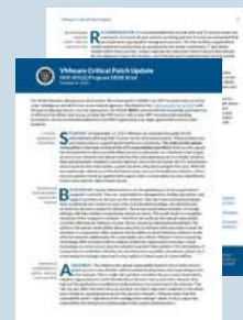
VMware Critical Patch Update SBAR