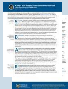
Kaseya VSA Supply Chain Ransomware Attack SBAR

In order to help the HPH sector better respond to cybersecurity events, the 405(d) Program established a Tiger Team, which consists of 405(d) Task Group members that discuss time-sensitive cybersecurity alerts and events that are relevant to the HPH sector. The Tiger team develops an SBAR Situation, Background, Assessment, and Recommendation product that is tailored specifically for the HPH sector. The Recommendations are all pulled from the HICP Publication. This is a new 405(d) product and in 2021, we released three of these quick turnaround reports.